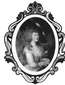
The Duchess of Devonshire by Gainsborough