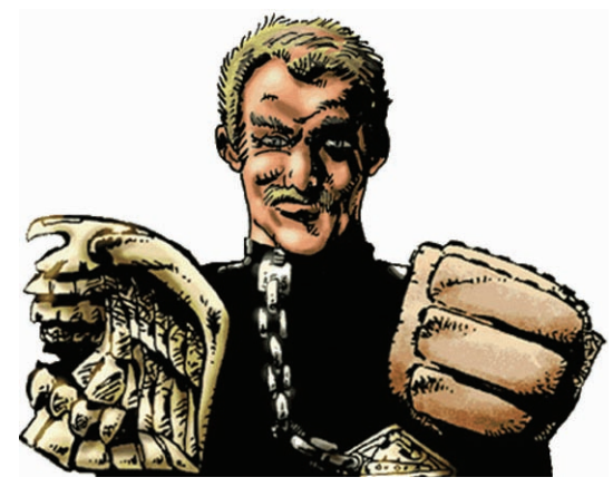
Fig 5 Hed 5 Nim 6 Psi 0 Spd 5 Str 4