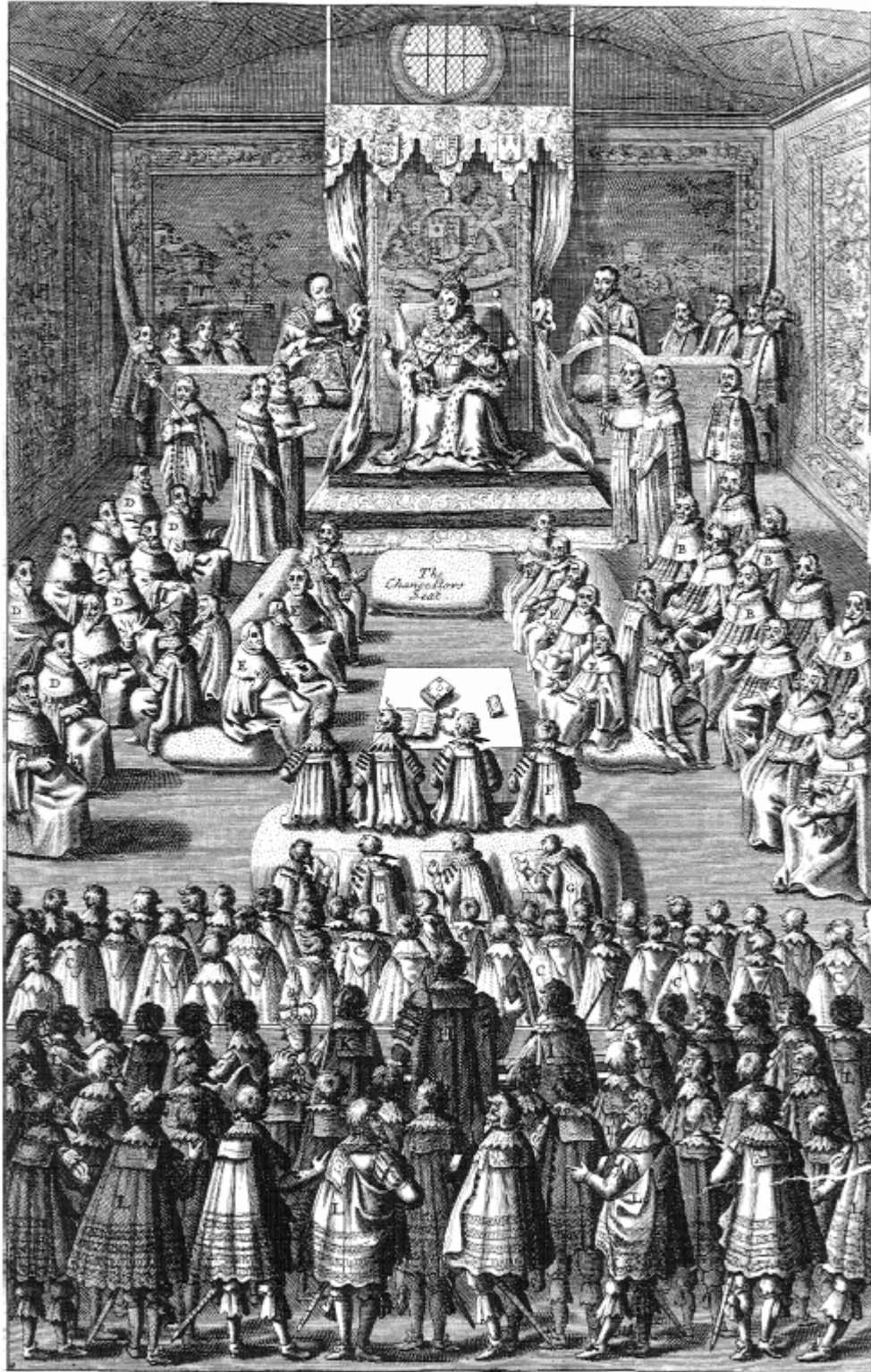
“QUEEN ELIZABETH IN PARLIAMENT A. The Chancellor B. Marquises, Earles C. Barons D. Bishops E. Judges F. Masters of Chancery G. Clerks H. Speaker of the Commons I. Black Rod K. Serjeant at Arms L. Members of the Commons house M. S. Francis Walsingham Secretary of State.

Queen Elizabeth in Parliament four hundred years ago